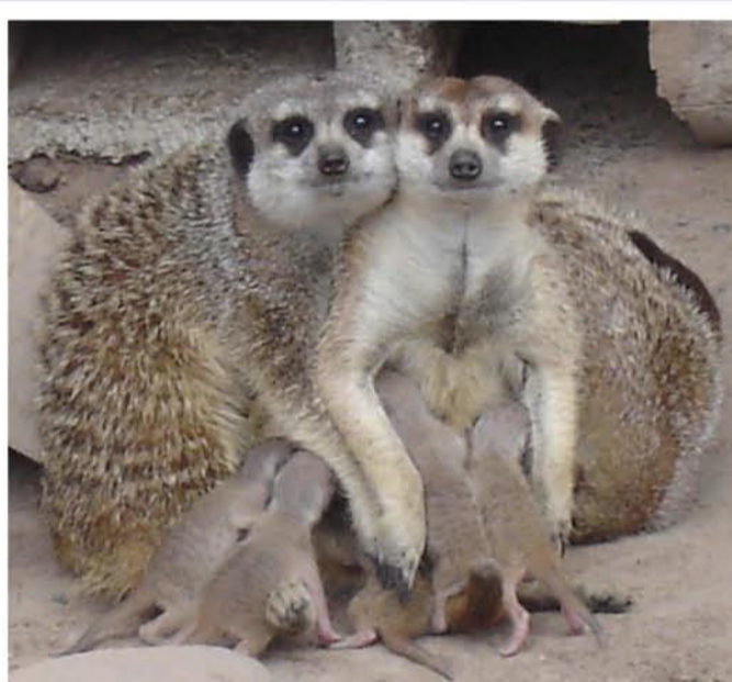
Everybody say cheese!

Six Meerkats have just been born after what seemed like the longest pregnancy on earth! Once the mother has given birth, it is the job of other females in the group to look after the youngsters. Unfortunately the adults were not doing a very good job at looking after the babies and were leaving them outside in the cold. The decision was made to take the babies away and hand raise them. Three of the Meerkats have gone to a new home and are doing well. The other three are being bottle fed milk every four hours and are fattening up nicely! This feeding will continue until they are weaned between 7 and 9 weeks old. The babies opened their eyes a week ago and are now starting to stand up on their hind legs and climb anywhere they can!