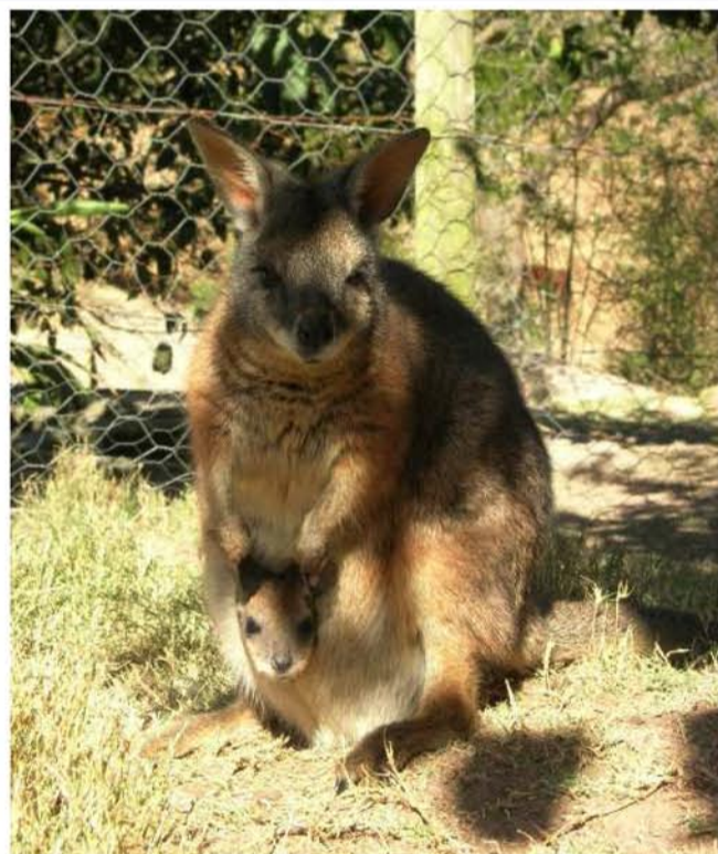
Interpouch – The only way to travel

The winter months also saw two new faces pop up in the wallaby enclosure. The two babies are still being carried in the pouches with the odd head or leg poking out from time to time!